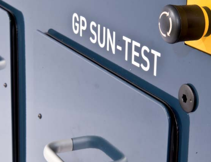
GP SUN-TEST Pro helps to identify loss mechanisms